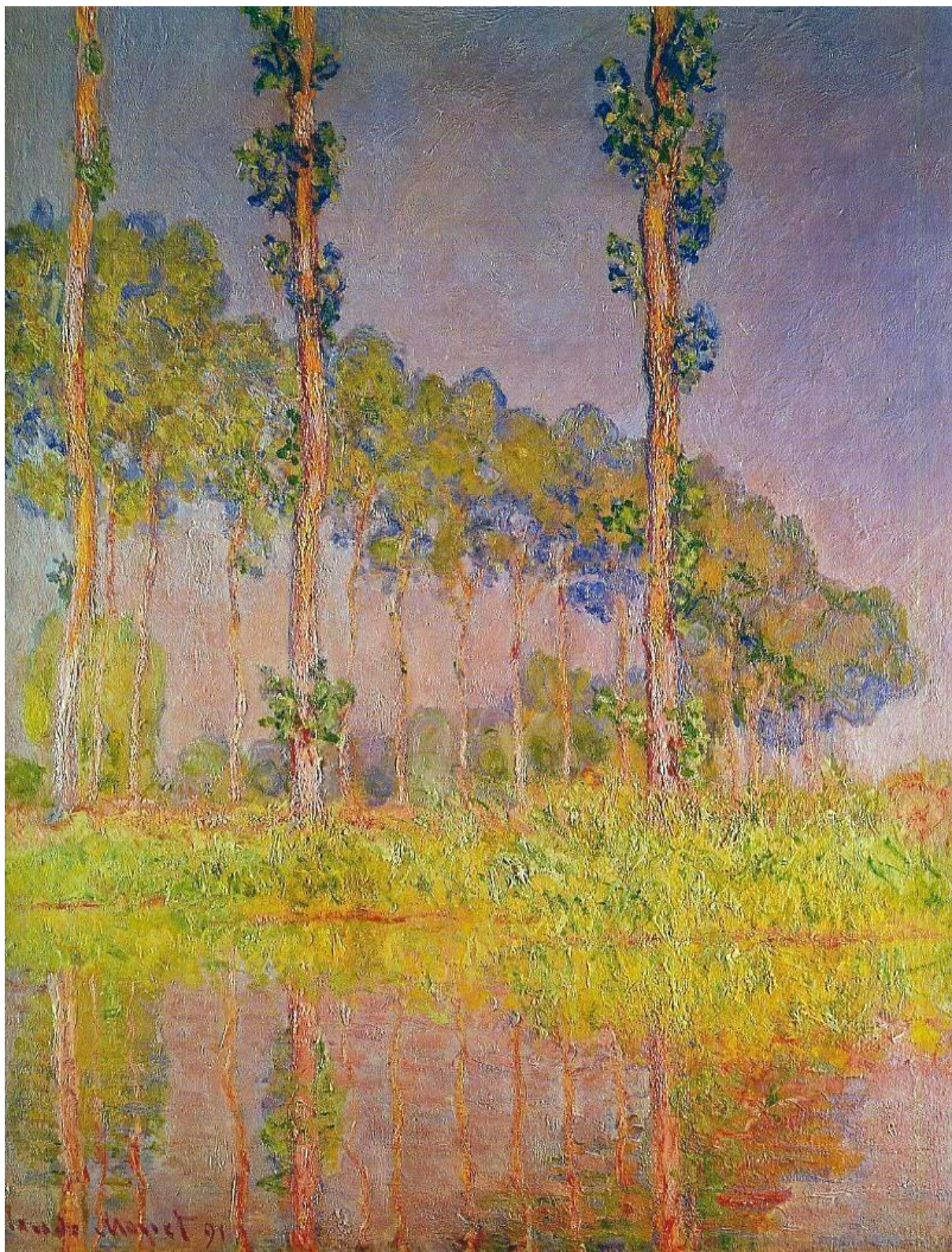
Claude Oscar Monet: Three Trees In Spring