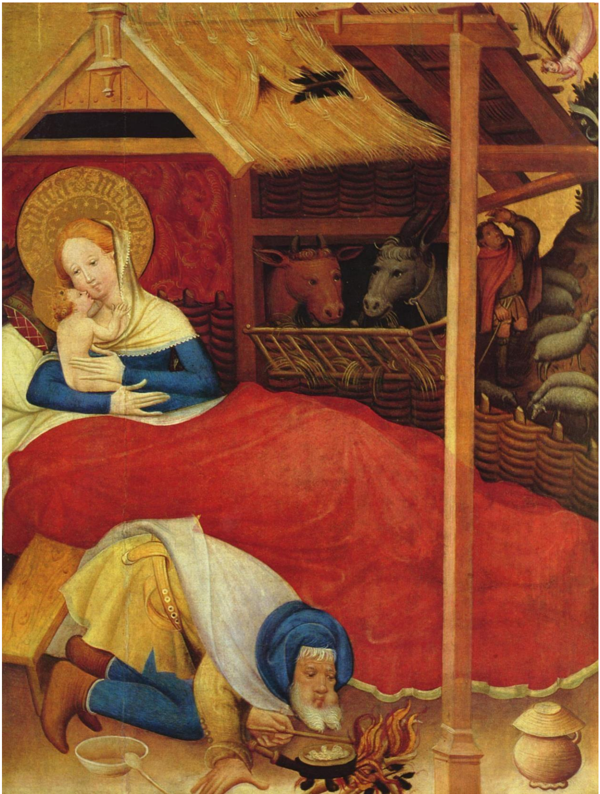
Conrad von Soest: The Nativity